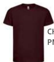
CHOCOLATE PMS 497C