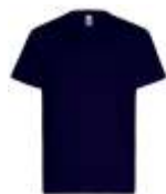
NAVY PMS 533C