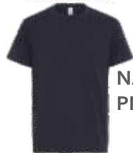
NAVY PMS 5255C