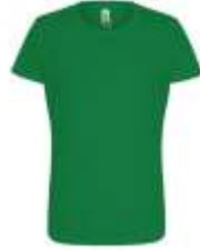
EMERALD PMS 341C