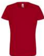
RED PMS 200C