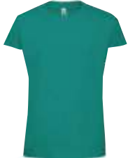
AQUA PMS 320C