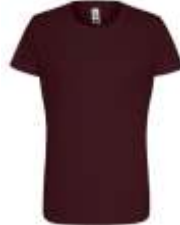
CHOCOLATE PMS 497C