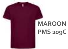
MAROON PMS 209C