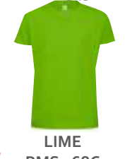
LIME PMS 368C