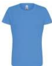
SKY PMS 284C