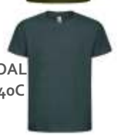
CHARCOAL PMS 7540C