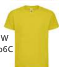
YELLOW PMS 106C