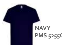
NAVY PMS 5255C