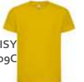
DAISY PMS 109C