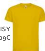
DAISY PMS 109C