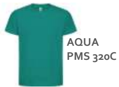
AQUA PMS 320C