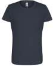
CHARCOAL PMS 7540C