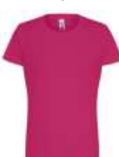
HOT PINK PMS 205C