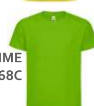
LIME PMS 368C