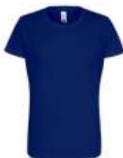
ROYAL PMS 281C