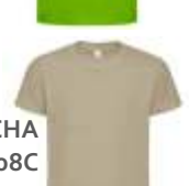
MOCHA PMS 408C