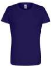
PURPLE PMS 2685C