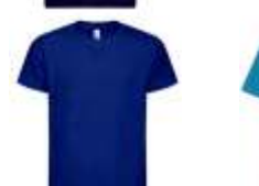
ROYAL PMS 281C