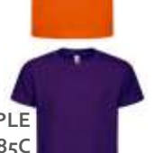
PURPLE PMS 2685C