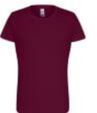
MAROON PMS 209C