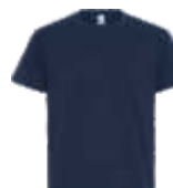
PETROL PMS 432C