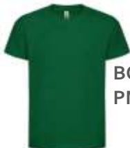
BOTTLE PMS 343C