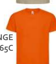
ORANGE PMS 165C