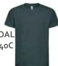
CHARCOAL PMS 7540C