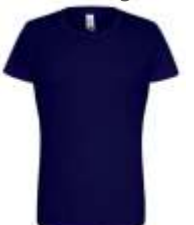
NAVY PMS 5255C