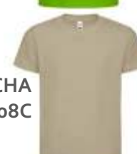
MOCHA PMS 408C