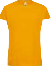
GOLD PMS 1375C