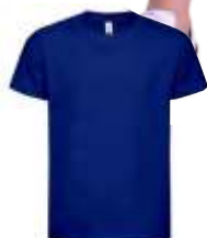
ROYAL PMS 281C