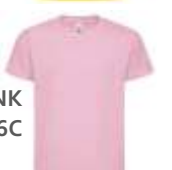
PINK PMS 496C