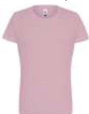
SOFT PINK PMS 496C