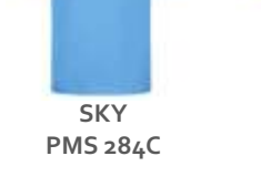
SKY PMS 284C