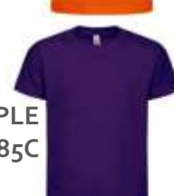
PURPLE PMS 2685C