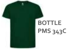
BOTTLE PMS 343C