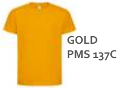
GOLD PMS 137C