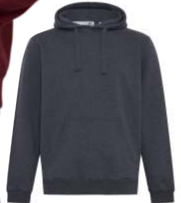
DARK GREY MARLE