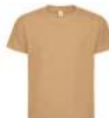
SAND PMS 727C