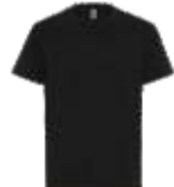
MINERAL PMS 7543C