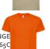
ORANGE PMS 165C