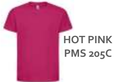
HOT PINK PMS 205C