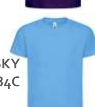
SKY PMS 284C