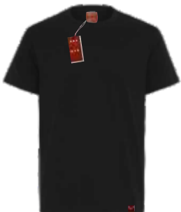
CHARCOAL PMS 418C