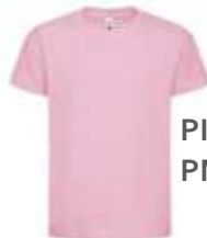
PINK PMS 496C