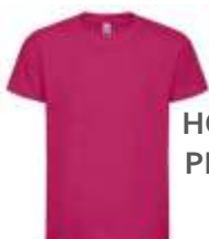
HOT PINK PMS 205C