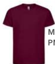
MAROON PMS 209C