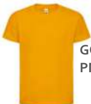
GOLD PMS 137C