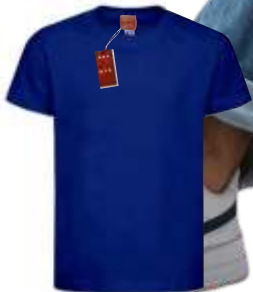
ROYAL PMS 281C