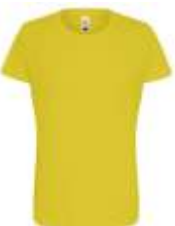
YELLOW PMS 106C