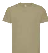
CAMEL PMS 7503C