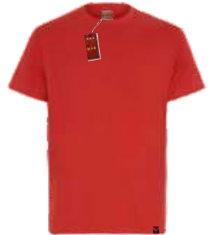
RED PMS 200C