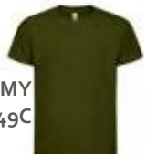
ARMY PMS 449C