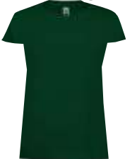
BOTTLE PMS 343C