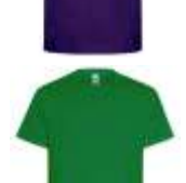
EMERALD PMS 341C