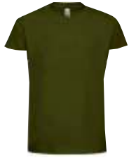
ARMY PMS 449C