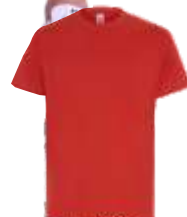
RED PMS 200C