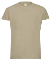
MOCHA PMS 408C