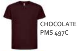
CHOCOLATE PMS 497C