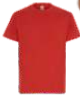
RED PMS 200C