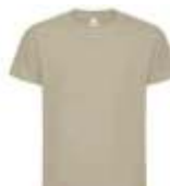
BONE PMS 406C