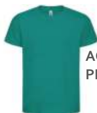
AQUA PMS 320C