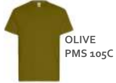
OLIVE PMS 105C