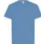
PALE BLUE PMS 2705C