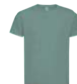
CYPRUS PMS 5625C