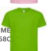
LIME PMS 368C