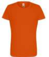
ORANGE PMS 165C