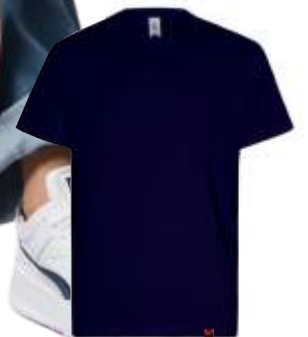
NAVY PMS 533C