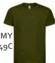
ARMY PMS 449C